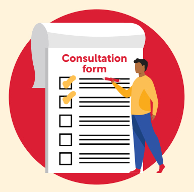
Fill out our consultation form