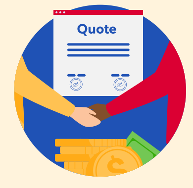
Get a free quote